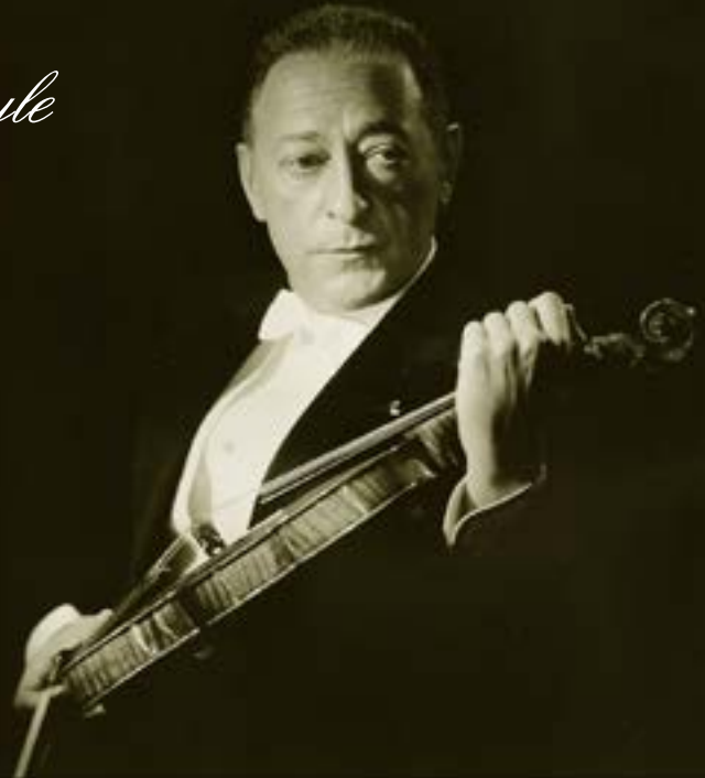
JASCHA HEIFETZ (1901–1987)