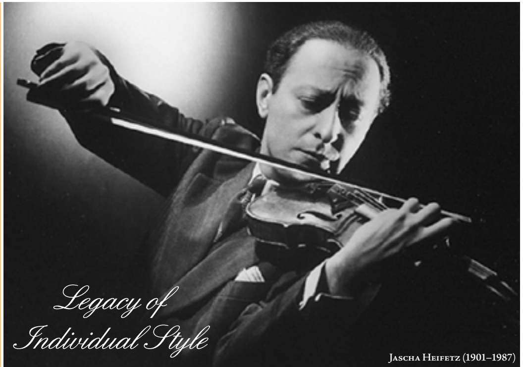
JASCHA HEIFETZ (1901–1987)