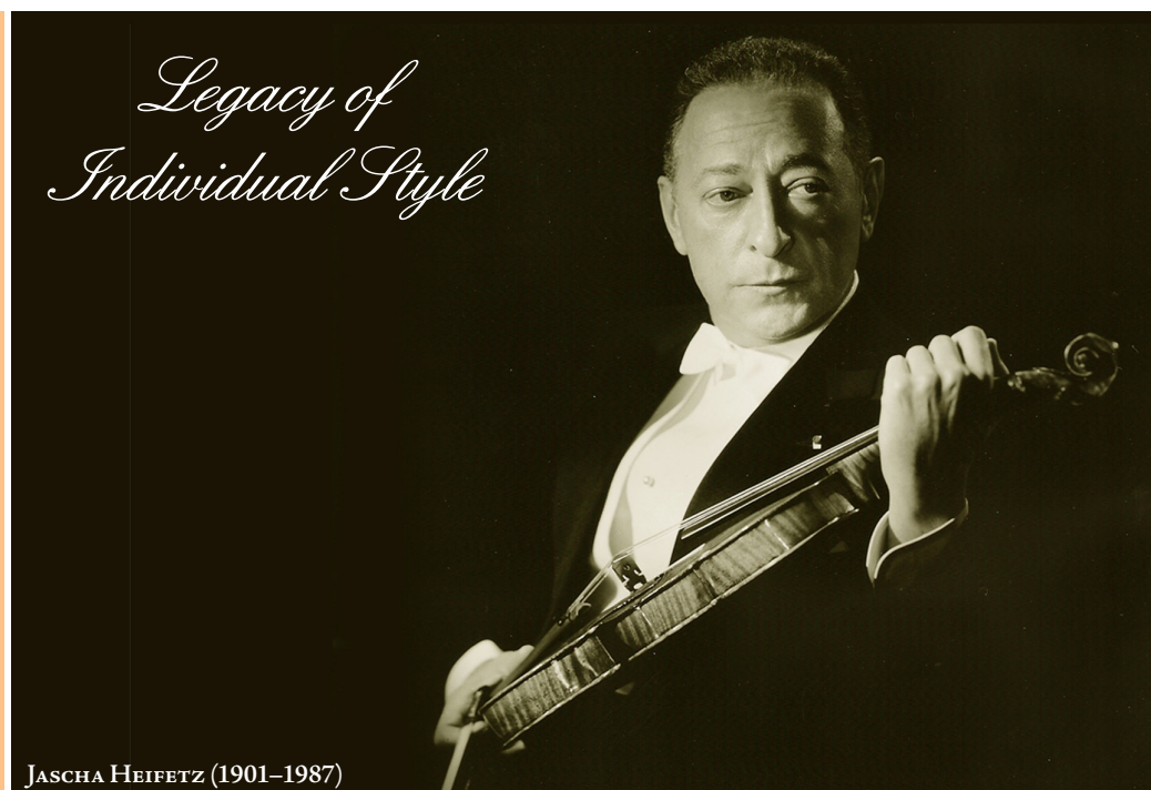
JASCHA HEIFETZ (1901–1987)

"My daughter has become more focused and practices away on the piano AND violin since JHS, inspired by the wonderful teaching and overall group dynamics. What a talented staff and group of student musicians."