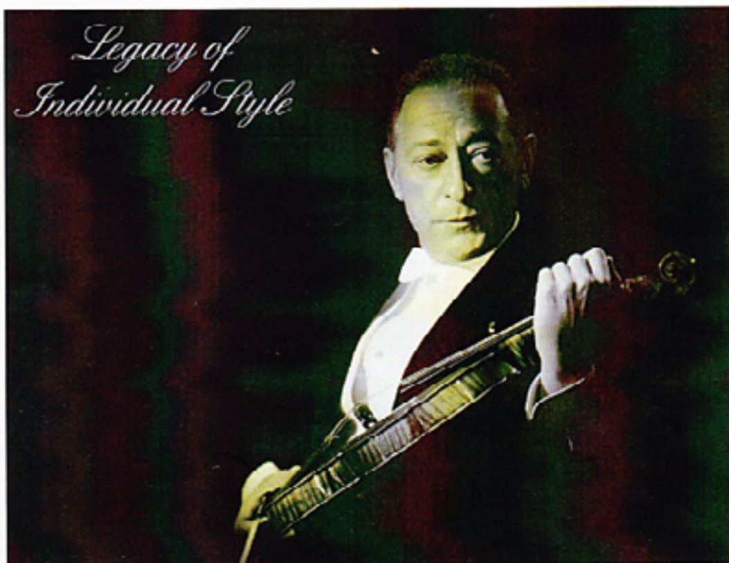
JASCHA HEIFETZ (1901–1987)

"Thank you for the wonderful Symposium. I came away with many new great ideas to improve my playing and had an extremely positive experience meeting everyone. Wish it was all year round!"