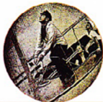
It's on the beat

of the Great Masters Instantly Recognizable Trademarks.